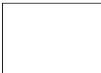
圖 1 XX