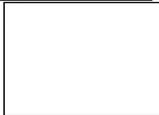
圖 1 XX