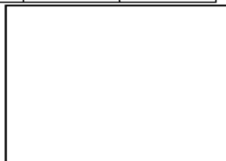
Figure 1 XX